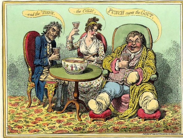
Fig. 3 A caricature of the “hereditary diseases” of the aristocracy. The hand-coloured etching entitled “Punch cures the Gout, -the Colic,- and the ‘Tisick (1799),” created by the famous caricaturist and print-maker James Gillray (1756–1815), also called “the father of political cartoon,” humorously illustrates the “noble characters” of the aristocracy.