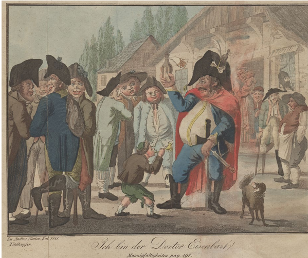
Fig. 4 The fold-out image of Doctor Eisenbarth from Christian Carl André's National Calendar (1821).