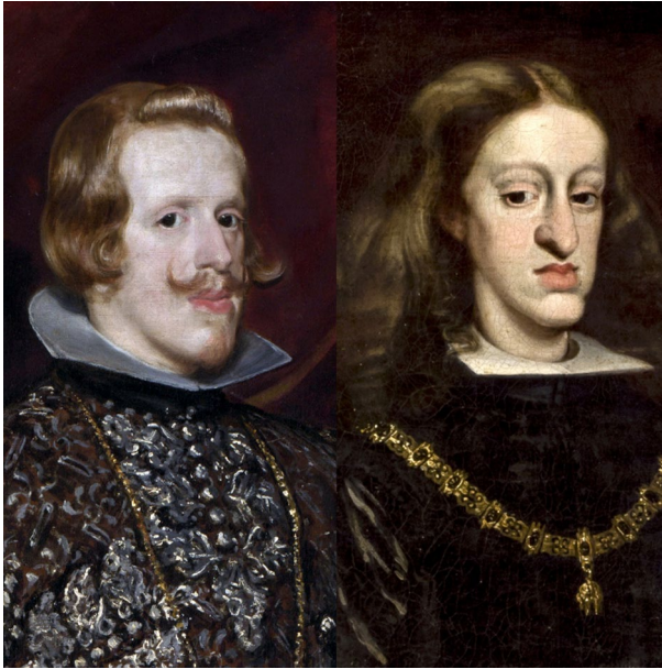
Fig. 1 Portrait of Philip IV (1605–1665) on the left, and his son and successor Charles II of Spain (1665–1700) on the right. Oil painting of Philip IV in brown and silver by Diego Velázquez (1599–1660) ca. 1631 (National Gallery, London, UK); portrait of Charles II by Juan Carreño de Miranda (1612–1685) ca. 1685.

The patronage of the absolutist Habsburg Emperor aided the cognitive legitimization of this new scientific endeavor by providing forums for the social acceptance of inbreeding, which improved the epistemological validity of the method. The rise, consolidation, and further growth of the physical sciences' prominence over several centuries had been made possible by similar patronage (Westman 1980, pp. 105–147). For astronomers like Nicolaus Copernicus (1473–1543), Tycho Brahe (1546–1601), Johannes Kepler (1671–1630), and Galileo Galilei (1564–1642), the patronage system and royal standards had formed a new agenda in their search for the true system of the world (Jardine 1998, p. 49). Mario Biagioli revealed how Galileo used the patronage of the Medicis to become an influential academic in the culture of absolutism (1993, p. 59). This all turned to dust when he lost the support of his two most important patrons during the events of what is now called the Galileo affair (Westfall 1985, pp. 11–30; Finocchiaro 1989). Astronomers promised that the information they created would not only advance the understanding of the world but also the reputation and power of their patrons. The members of MAS did not simply turn breeding experiments into a body of timeless theory on heredity; they also produced an extensive amount of cheap wool for the military campaigns of the emperor, who was struggling to keep his power.